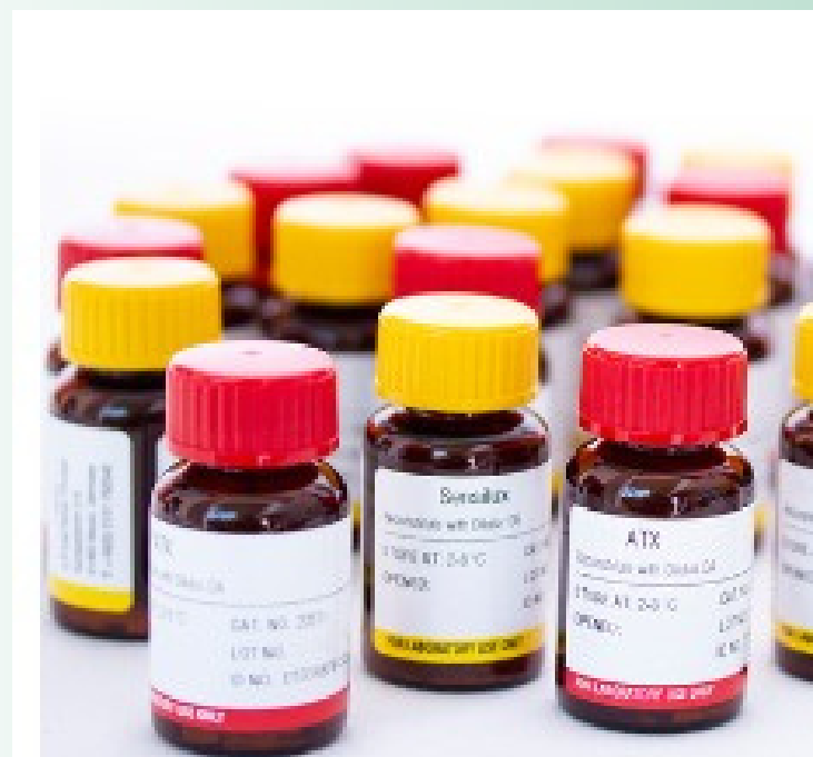
CRM - Pesticide