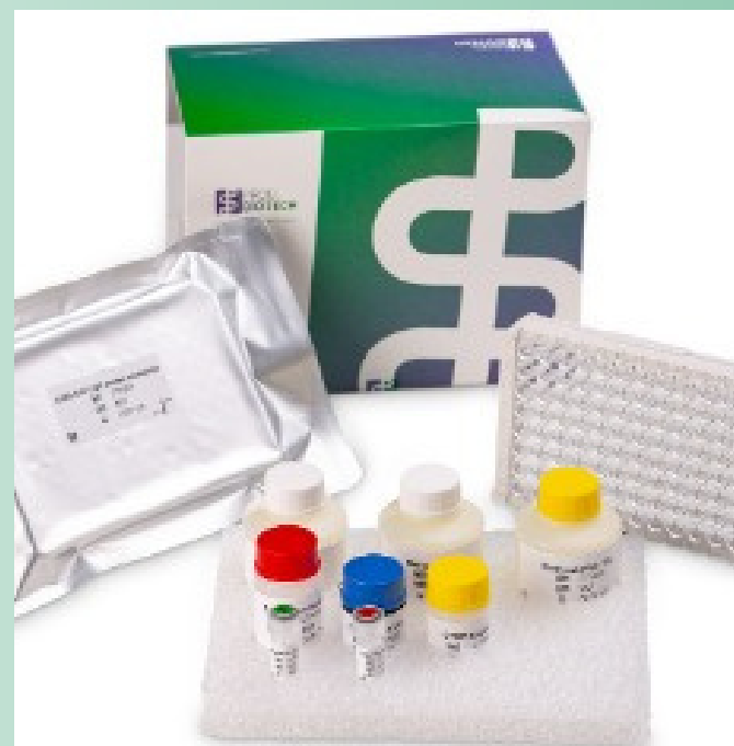
ELISA - Kit