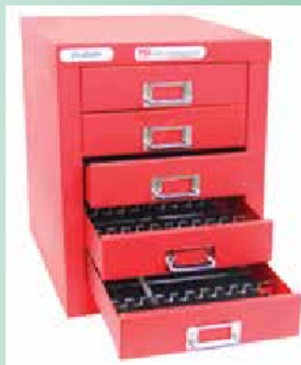
LC Column Cabinet