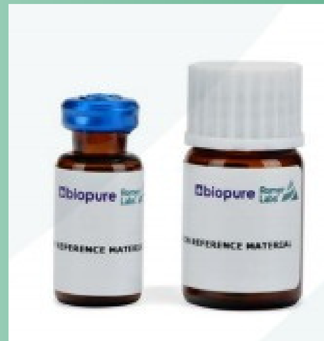
CRM - Antibiotic