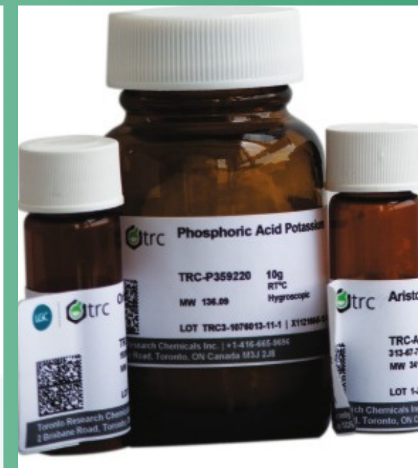
CRM - Mycotoxin