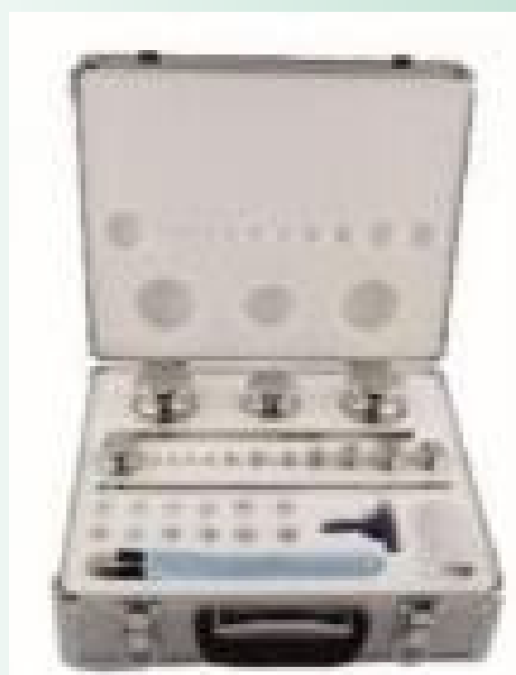
Weight - E & F