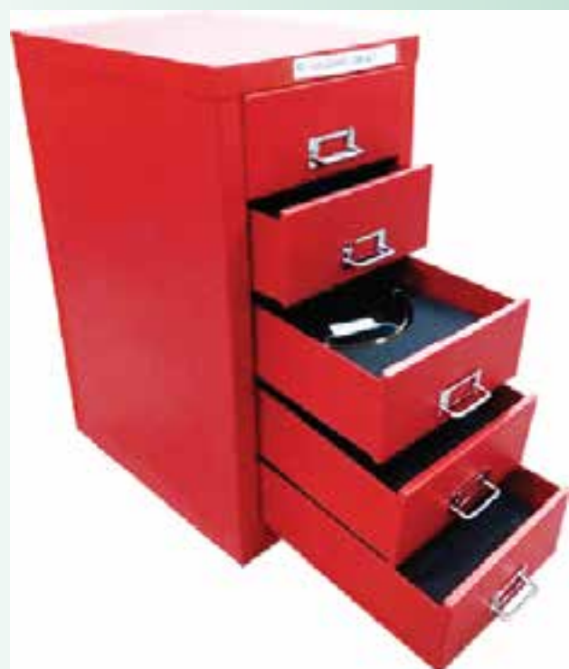
GC Column Cabinet