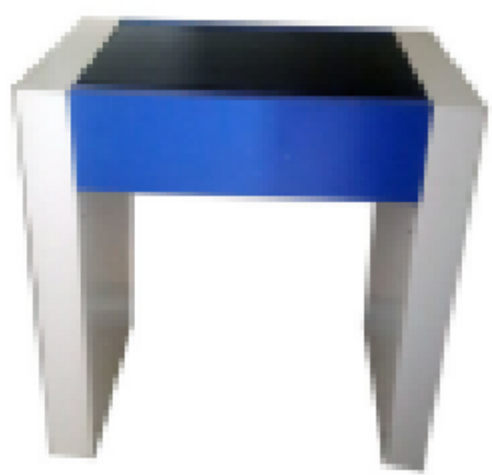
ANTI VIBRATION TABLE