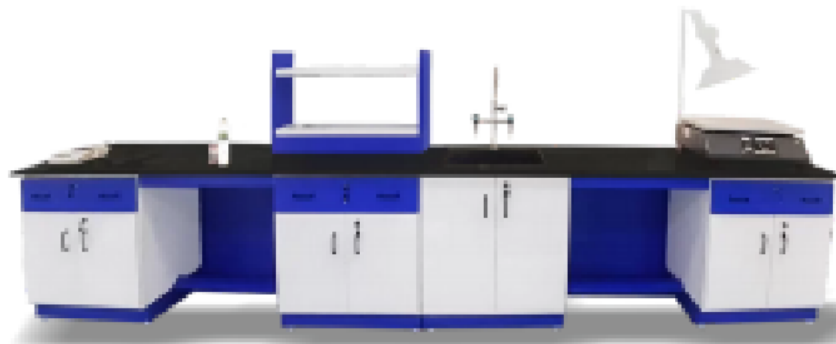
LAB FURNITURE SETUP